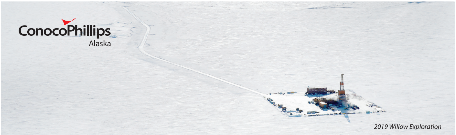
2019 Willow Exploration